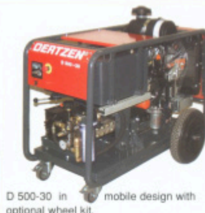
D 500-30 in mobile design with optional wheel kit.

All kind of resistant dirt will be removed by max. working power of 500 bar. For explosion endangered sites: BRW 550 INOX EX.